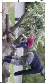
Tree scambler for the natural play area