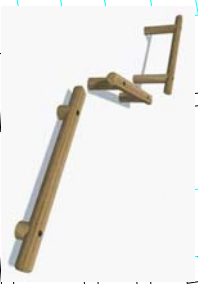
Sovereign Play balancing beams for the natural play area