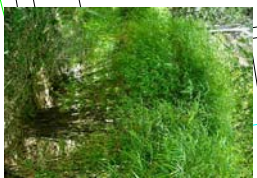
Bamboos for the natural play area