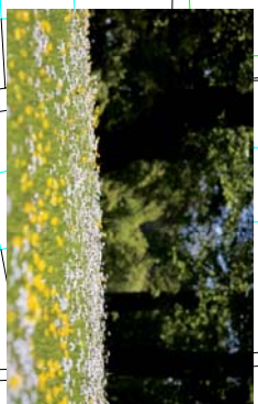
Example of wildflower planting

Flowering trees, shrubs and Crocus added across the frontage