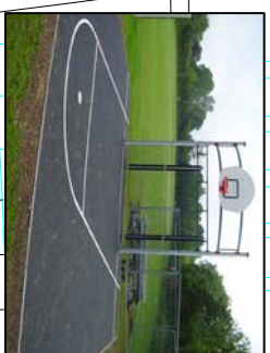
Sutcliffe goal end for the MUGA