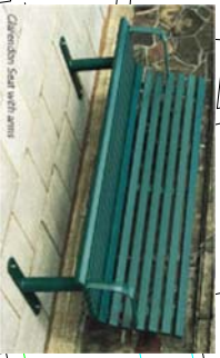
Streetmaster all steel seat